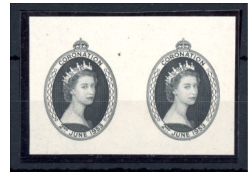
Plate Number format: 2 2, 2a 2a, etc

DLR imperforate proof pair of vignette in black on wove paper.