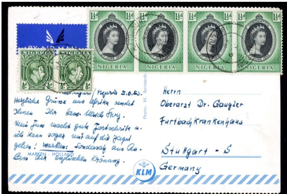
Nigeria: airmail PC to Germany, Maiduguri 6 June 1953 Rate: airmail PC to Europe 7d

I have found almost no commercial uses of this issue. A number should exist. Do you have any?